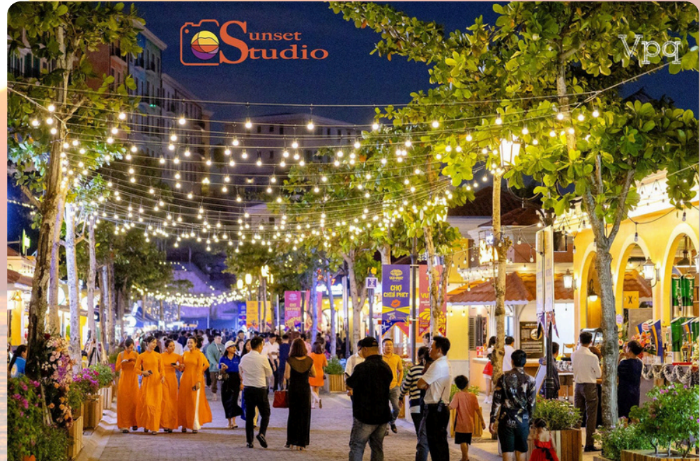
VUIFEST NIGHT MARKET