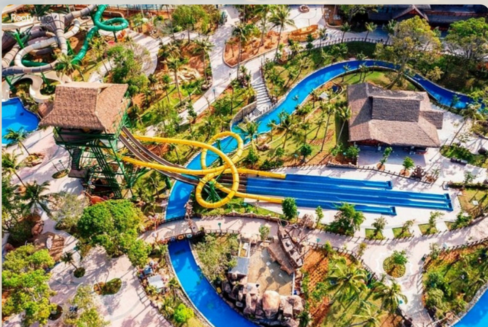
AQUATOPIA WATER PARK

Your day begins with an exciting 4 Islands Tour by speedboat . After breakfast, you'll be picked up from your hotel around 8:00 AM and head to the pier. The boat will depart around 9:00 AM, taking you to four beautiful islands off the southern coast of Phu Quoc. The first stop is Coral Park , where you'll enjoy snorkeling and discover the vibrant marine life beneath the clear waters. Then you'll head to Gam Ghi Island , known for its calm waters and relaxing beaches. After that, you'll visit May Rut Island , a perfect spot to swim, relax, and soak up the sun. The final island is Finger Island , another great place for snorkeling. By around 12:30 PM, you'll have a delicious lunch on one of the islands, then return to the mainland by about 1:30 PM.