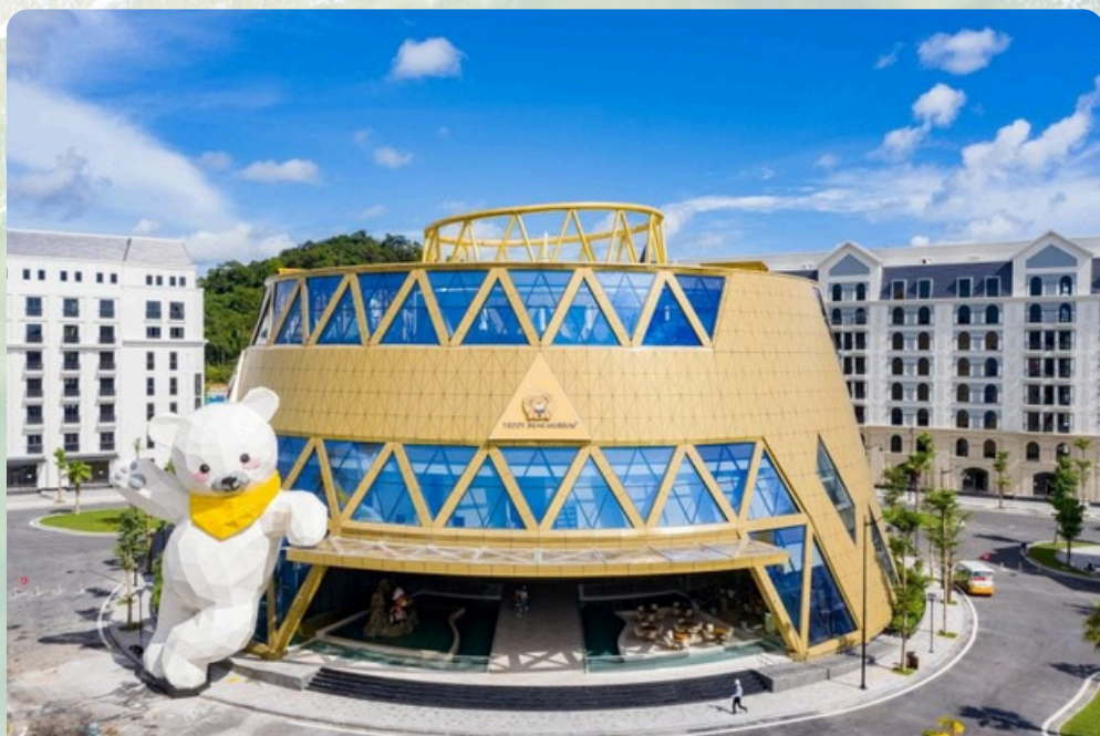
TEDDY BEAR MUSEUM