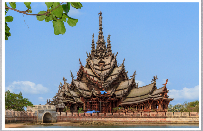
Sanctury of Truth