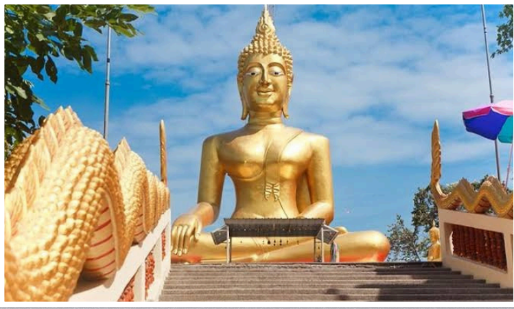
Big budha Statue